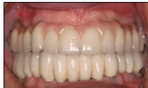
All ceramic hybrid prosthesis