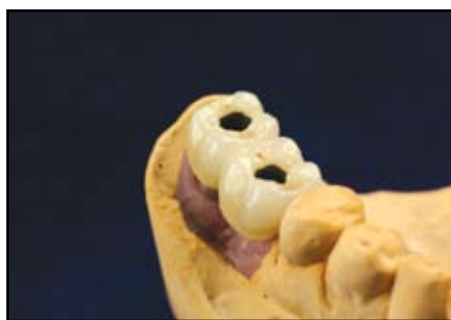
Left, long axis of 2 unit bridge