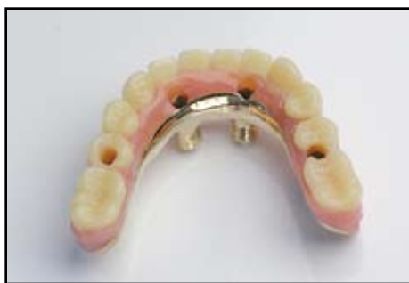
Left, long axis of hybrid implants