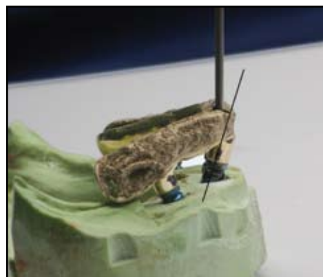
Above, occlusal view