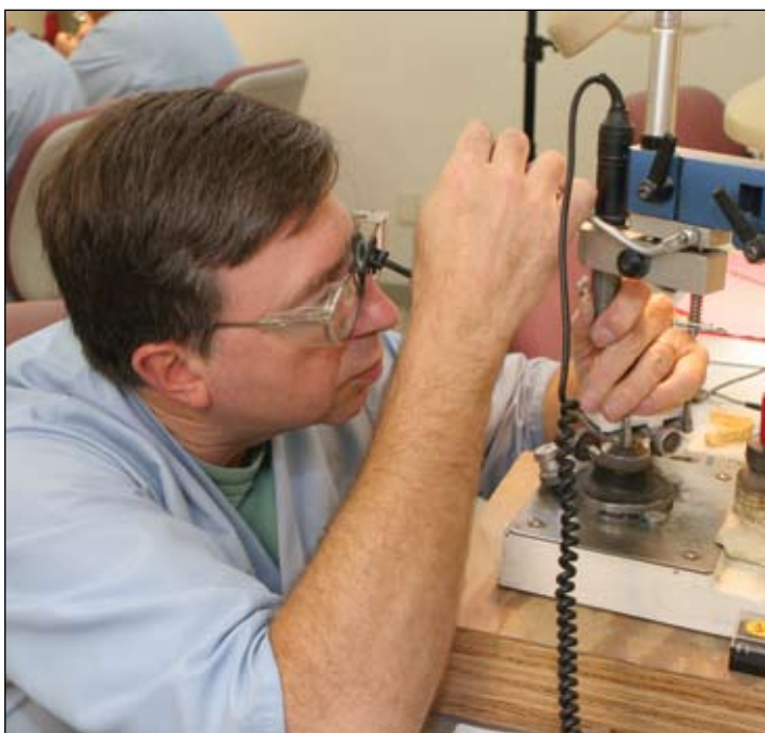
Quality and craftsmanship characterize every prosthesis we make.